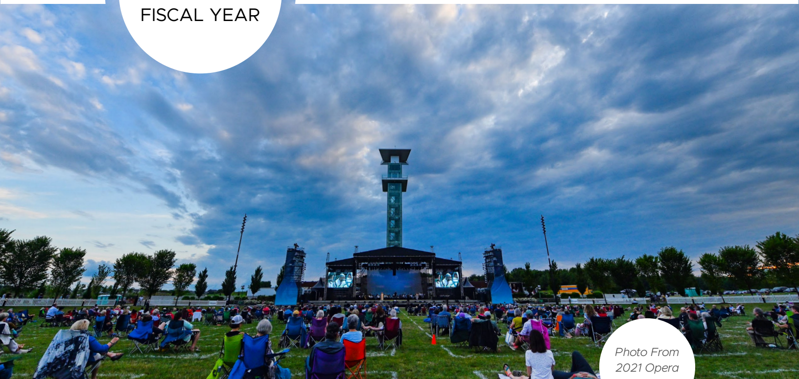
Photo From 2021 Opera in the Park